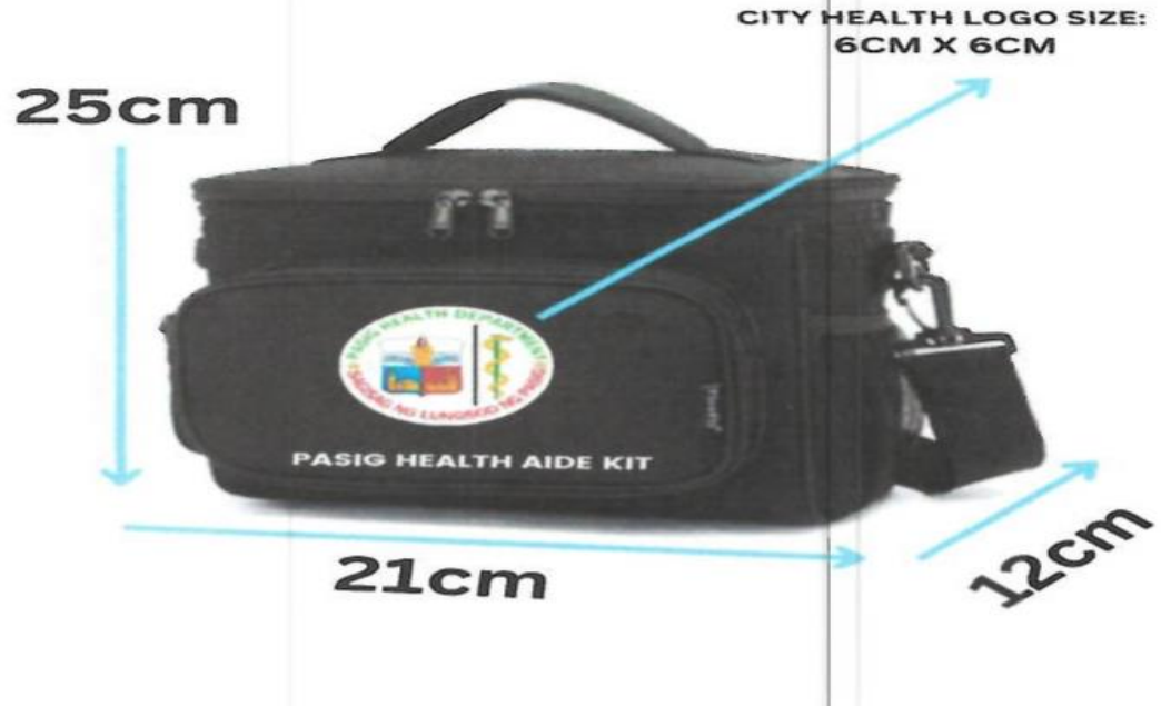
PHAs kit Sling bag with City Health Department logo